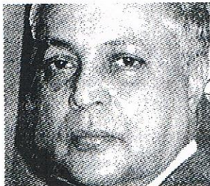
Legal billing ... Chaudhry's Labour lawyers are seeking $49,000.

A High Court decision last month directed that the Fiji Labour Party is entitled